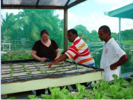
Region 2, Guyana

The evaluation teams were led by one Canadian municipal volunteer and one Caribbean LED volunteer. Each team reported on findings and proposed follow up activities for stakeholders, including CARILED, that could promote sustainability or enhance local economic development initiatives moving forward.