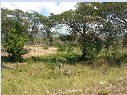
Land area in Portmore designated for the Ackee Village Project