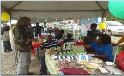
St. Catherine, Jamaica Business Fair & Exposition

This activity identified the legal mandate of the Local Authorities to enact laws that affect MSMEs and explored the common barriers that MSMEs experience at the local level. Some of the recommendations included instituting an MSME Help Desk in each council and community outreach initiatives.