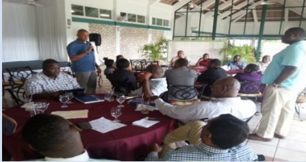
Ease of Doing Business consultation in St. Catherine

The final round of consultations on the Ease of Doing Business was completed in the parishes of St. Catherine, Clarendon, Westmoreland and Manchester, Jamaica this quarter.