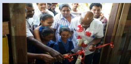
Minister Whittaker commissioning the Friendship Swine Development Project with children of Region 4

On January 21, 2015 the Friendship Swine Development Project in Region 4, Guyana was commissioned by the Honourable Minister Norman Whittaker, Local Government and Regional Development (MLGRD). The ceremony included the signing of a public-private partnership between the beneficiaries of the project, the MLGRD and CARILED.