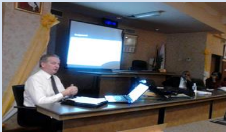
LED Strategic planning presentation to the Kingston Redevelopment Committee

The fair aimed to provide networking opportunities for MSMEs. Information was also available to MSMEs seeking direct assistance from business development agencies and other sources of funding.