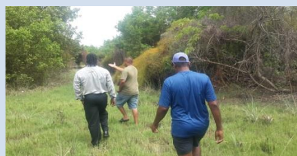
Members of the Livestock Association inspect the proposed site of the ULPRP LDP.

MORE will be supported by the Region 2 Regional Democratic Council, the Region 6 LED-PAC, the Mainstay Farmers Association and CARILED.