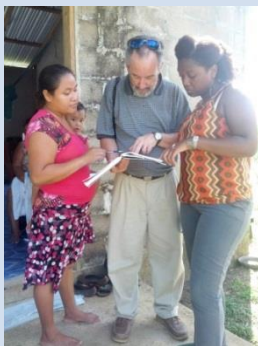
San Ignacio, Belize

CARILED undertook evaluations of fourteen (14) Local Economic Development Projects (LDPs) in six (6) Caribbean countries from January – March 2015.