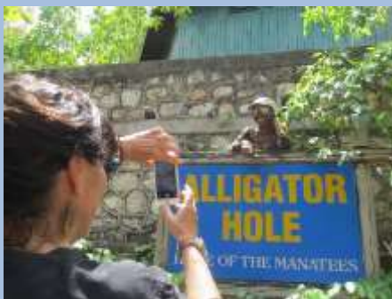
Clarendon, Jamaica.

This project is supported by the Gros Islet Constituency Council, the Gros Islet Development Partnership, the Government of Saint Lucia through the Ministry of Tourism's Heritage Development Program, Saint Lucia Hotel and Tourism Association, Saint Lucia National Trust, Gros Islet Vendors Association, Saint Lucia Tourist Board and CARILED.