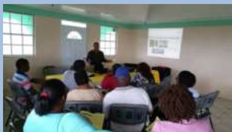
Woodford Hill, Dominica

CARILED continues to support the creation and implementation of Local Economic Development Strategic Plans (LSPs) in its countries of focus.