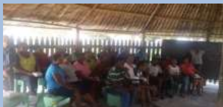
Region 2, Guyana

The Mainstay Organic Revitalization for Exports (MORE) in Region 2, Guyana has advanced with the completion of a draft operational manual and fee base system document. The Canal Polder Green Initiative Project in Region 3, Guyana has shown significant improvements in production, with the introduction of remedial designs of the greenhouse to increase output levels. Finally, the Mara Farmers Association in Region 6, Guyana is preparing a strategic business plan with expected finalization by March 2016.