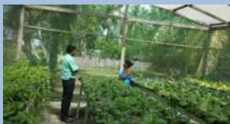
Region 3, Guyana

The Mainstay Organic Revitalization for Exports (MORE) in Region 2, Guyana has advanced with the completion of a draft operational manual and fee base system document. The Canal Polder Green Initiative Project in Region 3, Guyana has shown significant improvements in production, with the introduction of remedial designs of the greenhouse to increase output levels. Finally, the Mara Farmers Association in Region 6, Guyana is preparing a strategic business plan with expected finalization by March 2016.