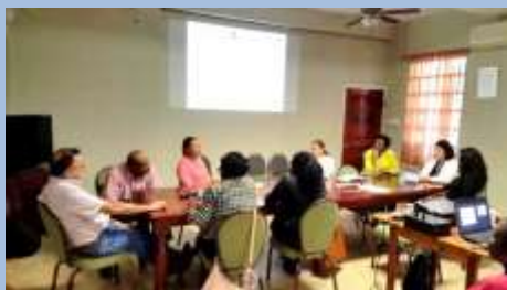
Belize City, Belize

Over the last 18 months, CARILED provided technical assistance to local authorities in Belize and Jamaica, to conduct assessments, consult local businesses and jointly identify, prioritize and act on recommendations to make communities more business-friendly. The activities were focused on understanding and supporting “Ease of Doing Business” within the local economies.