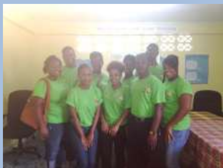
Soufriere, Saint Lucia

This project is being supported by the Fond St. Jacques Development Committee, the Soufriere Constituency Council, the Fond St. Jacques Catholic Church, the Ministry of Agriculture, Food Production, Fisheries and Rural Development, the Saint Lucia Social Development Fund, the Soufriere Region Development Foundation, the German Development Agency, FSJ Credit Cooperative and CARILED.