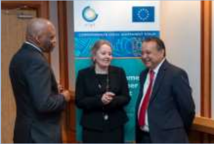
Port of Spain, Trinidad and Tobago.

The Commonwealth Local Government Forum launched its Caribbean office and Regional Programme under the CLGF-EC Grant Agreement on “Strengthening local government’s role as a partner in development” from March 21-22, 2016 in Port of Spain, Trinidad and Tobago. The launch was attended by local government association delegates from 8 Caribbean countries, representatives from Ministries with responsibility for Local Government from 3 countries and partner organizations such as the University of the West Indies (Mona and St. Augustine Campuses), the Caribbean Network for Urban and Land Management (CNULM), the European Union and Global Affairs Canada. Coverage on the event can be found at the Ministry of Local Government, Trinidad and Tobago’s website and Facebook page .