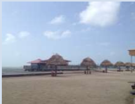
Belize City, Belize

This project is supported by the Belmopan City Council, the Belmopan LED Core Team, the Caribbean Community Climate Change Centre, a local credit union, private and corporate sponsors, embassies located in Belmopan and CARILED.