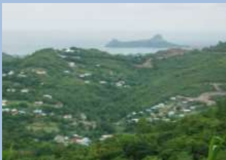
Gros Islet, Saint Lucia

The project is being supported by the Belize City Council, the Fort George Tourism Zone Committee, the Belize Tourism Board, SBDC/Beltraide, the management of the Fort George Tourism Village and CARILED.