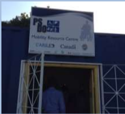
Municipality of Portmore, Jamaica

CARILED was invited to facilitate a session on the Role of Local Economic Development in achieving the Sustainable Development Goals. The CARILED presentation from this session can be viewed here . Delegates also took part in a one day session on March 23, 2016, hosted by the Government of Trinidad and Tobago, on local government reform, lessons learned and good practices. For more information on the work of the CLGF, visit www.clgf.org.uk