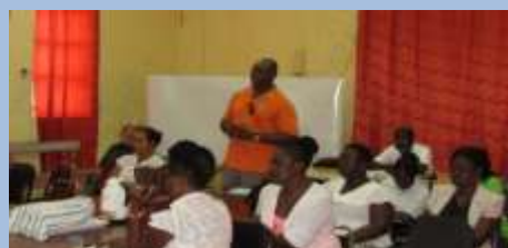
Presentation of draft MDP and consultation session in the town of Linden

The LED planning workshops provided residents with a greater understanding of community strengths and weaknesses, as well as the threats, opportunities and strategic action needed to bring about community prosperity. CARILED also supported the creation of a local area economic profile for the NDC of Port Mourant – John , Hague – Blankenburg. Local area economic profiles feed directly into the development of LED strategic plans for local communities.